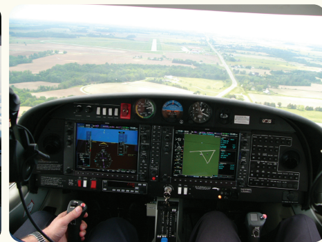
Exmple of a modern cockpit instrument panel

or brake, instead they are used to operate the rudder . When the pilot pushes the right pedal, the rudder moves to the right. It will move left when the left pedal is pushed. On some aircraft the brakes (which are used only on the ground), are located on the top of the floor pedals.