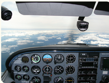
Exmple of an older cockpit instrument panel

On the floor of the cockpit are pedals. These pedals are not to accelerate